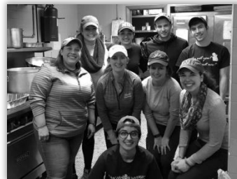
Niagara University St. Vincent de Paul Soup Kitchen